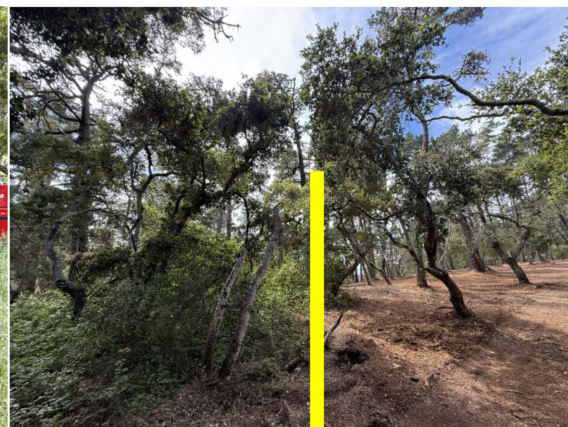
Non Treated compared to Treated